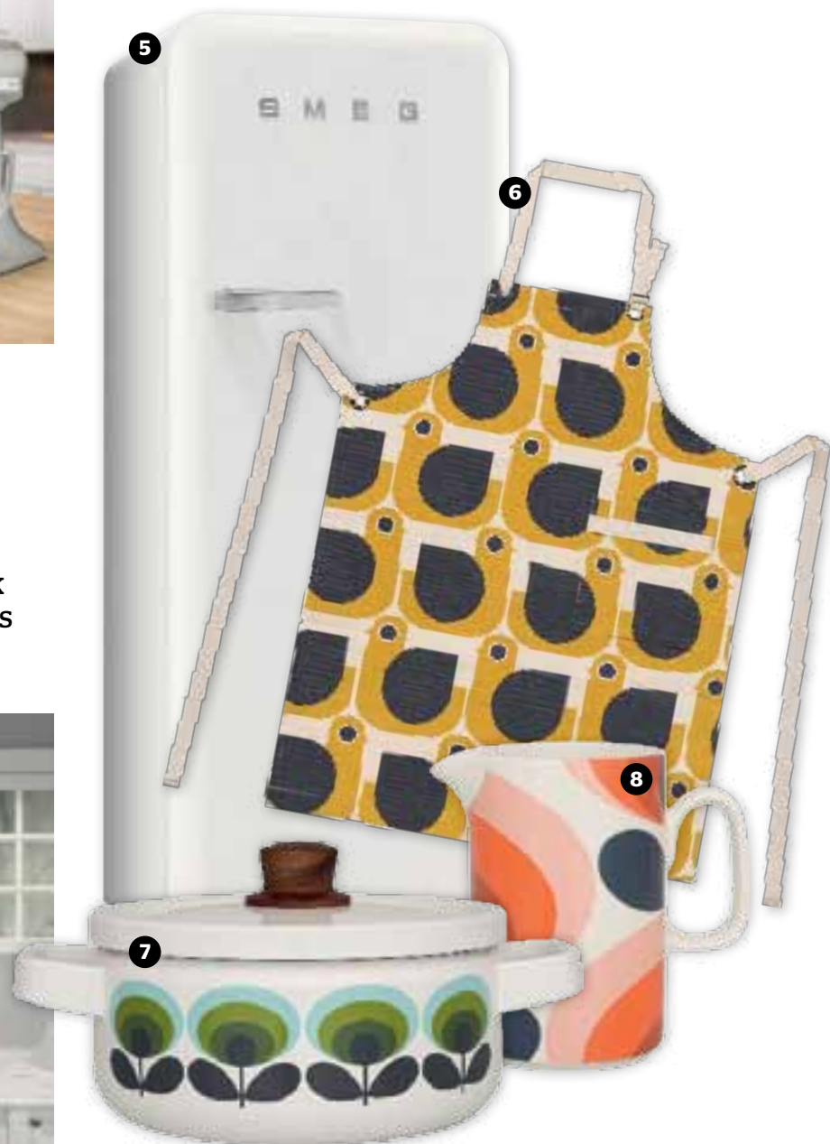
1 Smeg '50s-style toaster and kettle, smeg.com.au 2 The English Tapware Company Perrin & Rowe satin brass tapware, englishtapware.com.au 3 Kitchen Aid stand mixer in Platinum, kitchenaid.com.au 4 ILVE Quadra freestanding cooker, live.com.au 5 Smeg '50s-style fridge/freezer, smeg.com.au 6 Orla Kiely Hen apron, orlakiely.com/uk 7 Orla Kiely '70s Flower casserole dish, orlakiely.com/uk 8 Orla Kiely '70s Flower pitcher, orlakiely.com/uk

The vintage look is most common in small appliances and tableware, items which are easily exchanged if you change your mind, but if you're certain that this is the style you're after, built-in products like stoves and tapware really make a statement.